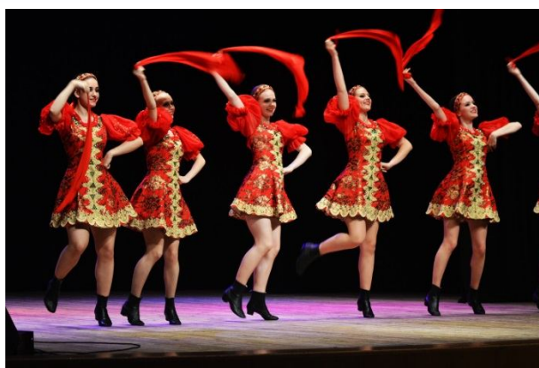
Concert of the creative dance group "LiK", 2018