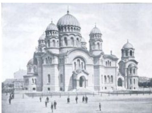
Riga Orthodox Cathedral built in 1884. (old photo)

The tradition “Days of Russian Culture in Latvia” (DRC) is the largest, very meaning for the Russianlanguage indigenous people of Latvia annual, mass event of the intangible cultural heritage. The first such holiday took place on September 20, 1925. Celebrations began in Riga, in the Cathedral, at 9 a.m.