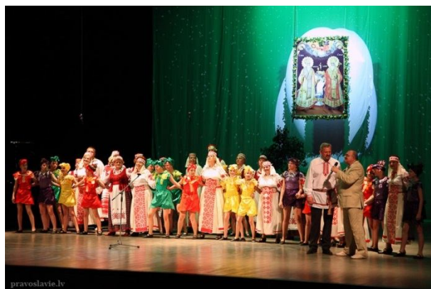
Participants of the concert dedicated to the Day of Slavic Writing, Daugavpils, 2013.