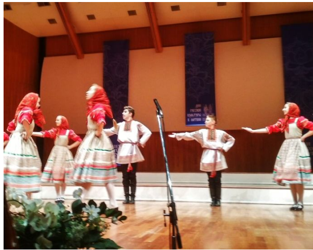
Children and youth dance group "Zadorinka" in Riga 2019