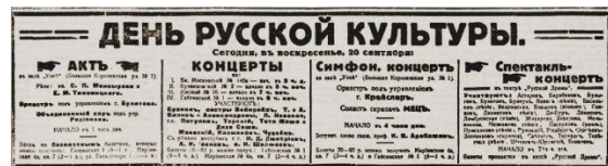
Riga, September 20, 1925.