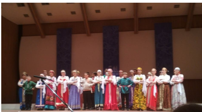
The performs choir "Zvonica" in Jelgava, 2019