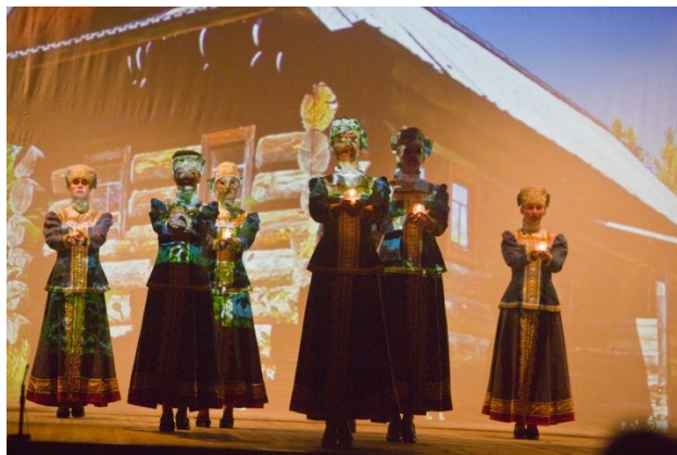
Dance group "Ivushki", Riga, 2016 г.