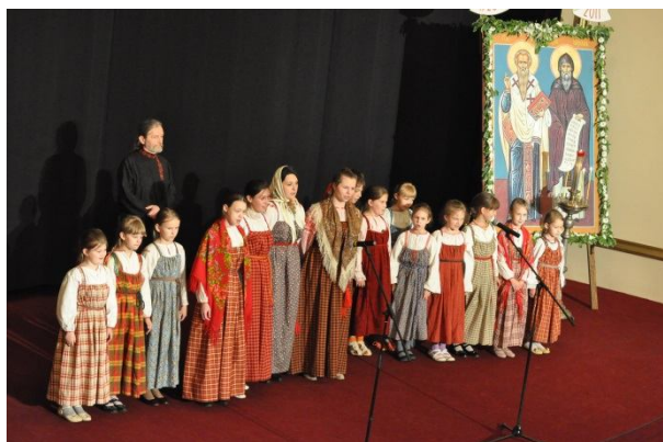
Folklore group of authentic music "Ilyinsky Friday", 2011