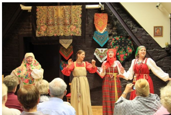
Performance of the amateur collective, 2011.