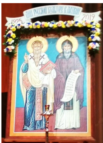
Icon of St. Cyril and Methodius