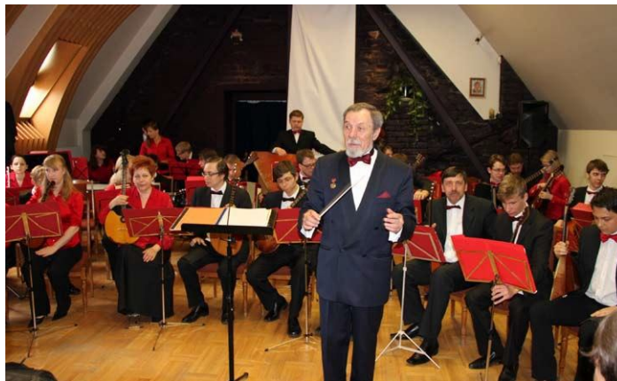
Performance of the orchestra of Russian folk instruments “Slavs” led by Victor Zhilyaev