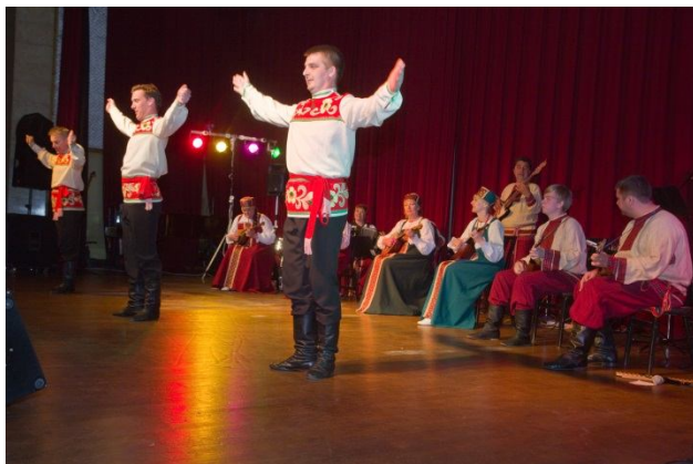
Dance group of Russian folk dance, Jurmala, 2016