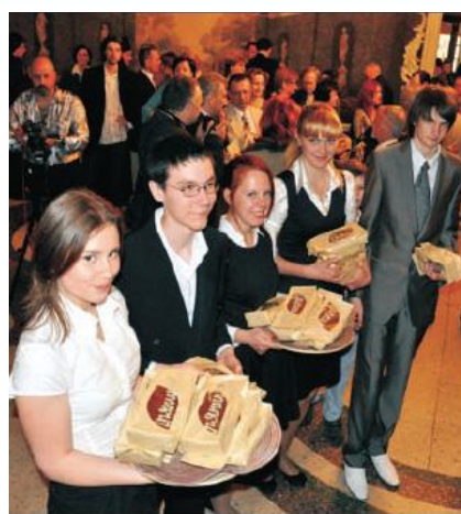
All guests were treated to a Russian-Latvian gingerbread specially baked for the holiday

In 2011, within the framework of the restored Days of Russian Culture in Latvia, 73 events were held, which took place in Riga, Daugavpils, Rezekne, Jurmala, Jaunolain, Jelgava, Wilani. These were performances, concerts, presentations of new books and almanacs, a large-scale family holiday was organized in the Verman Garden.