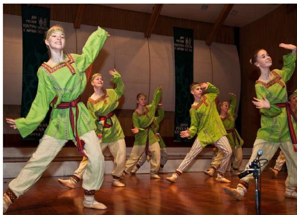
Performance of step studio Riga, 2014