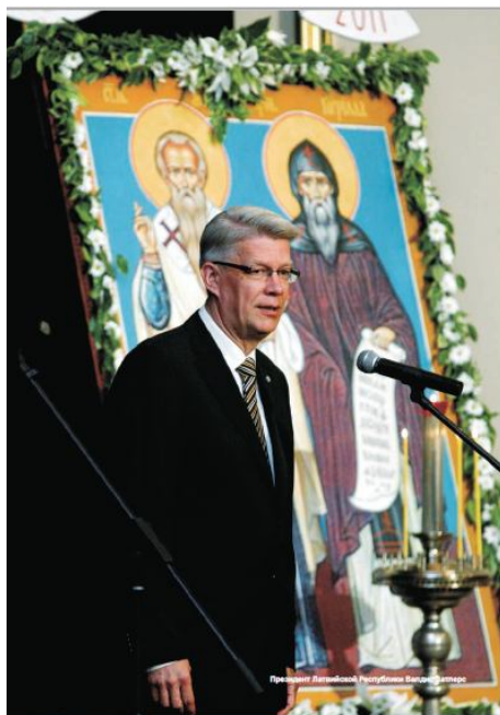
Photo of Latvian President V. Zatlers speaking at the opening Days of Russian Culture 2011.