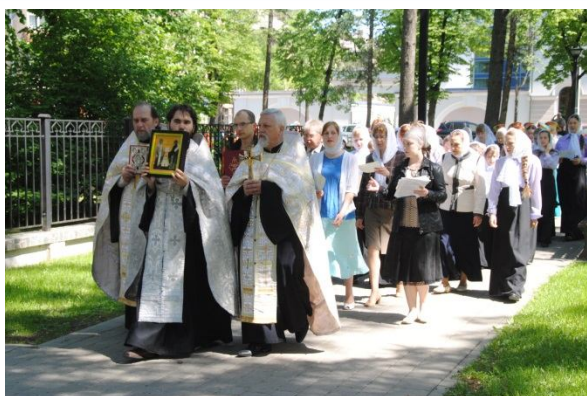
Religious procession on Slavic Writing Day, May 24, 2012, Daugavpils