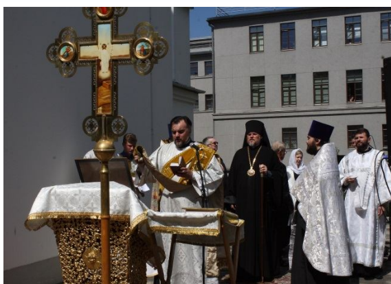
Solemn prayer in the Cathedral of Boris and Gleb on the day of St. Cyril and Methodius, Daugavpils, 2018