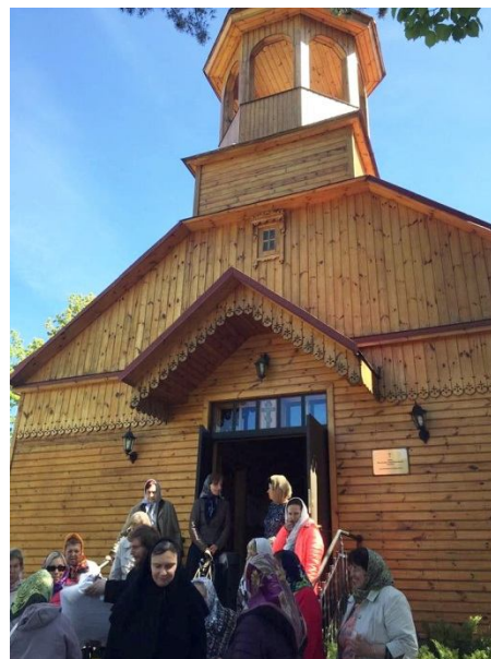
Excursion of the temples of Old Believers, Rezekne, 2017