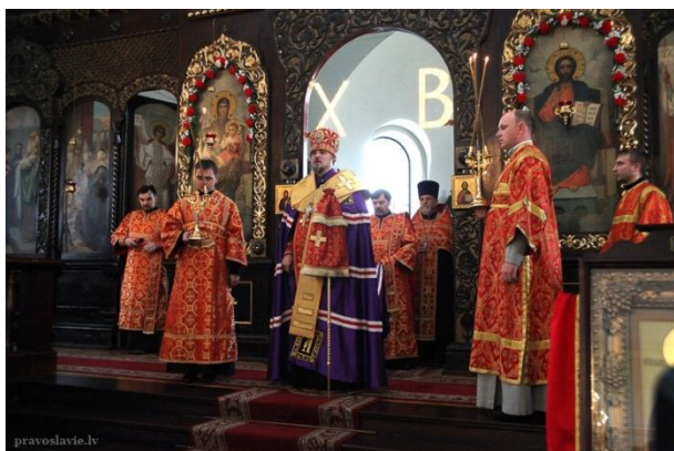
Liturgy in Day St. Cyril and Methodius, Daugavpils, 2013.