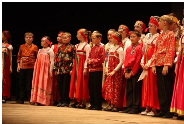
Performance of the children's dance group, Riga, 2014