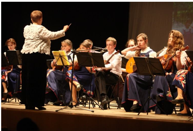
Orchestra of Russian folk instruments "Kadans", 2014