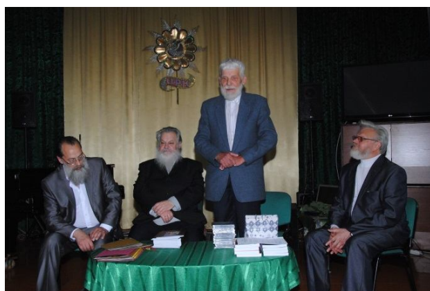
Competition of Research jobs on Old Belief in Latvia, Daugavpils, 2012