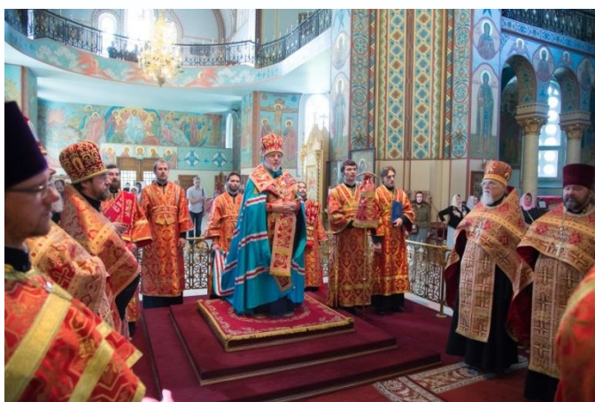
Liturgy in honor of St. Cyril and Methodius in the Riga Cathedral of the Nativity of Christ