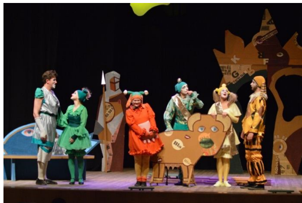
Tours of the City Theater "Yorik" from Rezekne in Riga