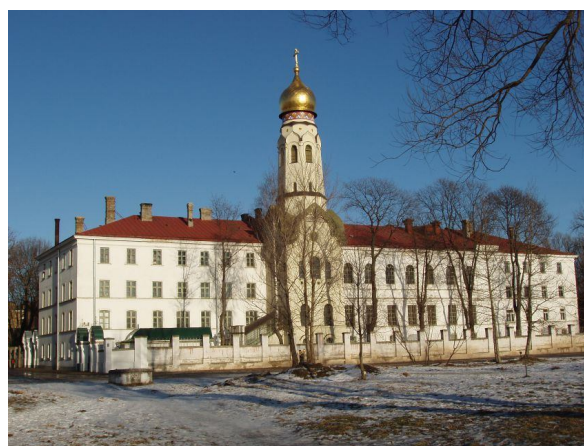
The largest in the world Old Orthodox Church (Grebenshchikova) in Riga, built in 1814