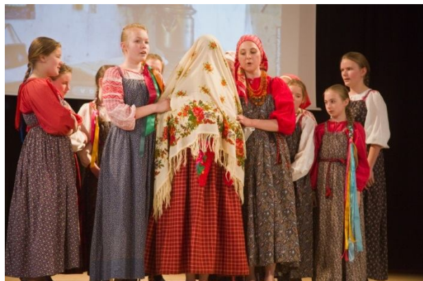
Performance of the Russian folklore group "Ilyinsky Friday"