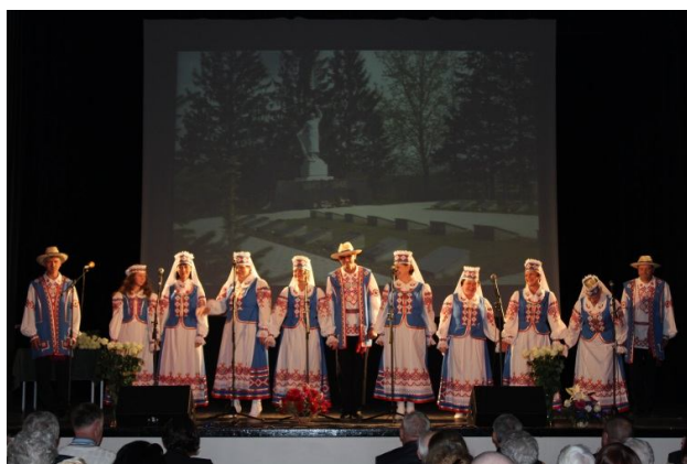
Russian Folk Song Choir, Liepaja, 2015