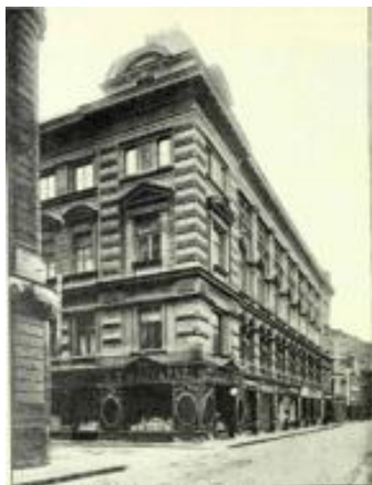
The building of the Society "Russian Hive" , Kalkyu Street (old photo).

On this day, several events were held at once in the Society "Russian Hive" building (today the M. Chekhov Russian Theater).