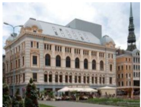
Now it this houses is the Riga Russian Theater, founded in 1883. (modern photo)