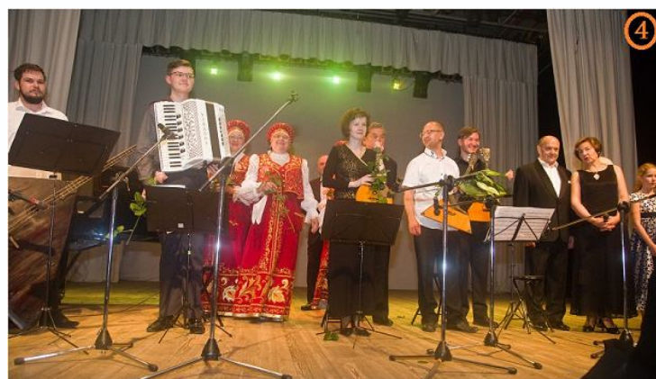
Closing of the Days of Russian Culture in Latvia on June 6, 2017