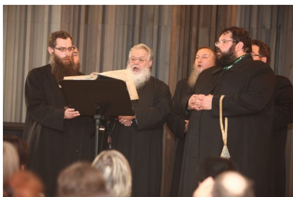
Choir Old Believer "Unison", performing Old Russian liturgical singing (singing on signs - on banners) ,2014