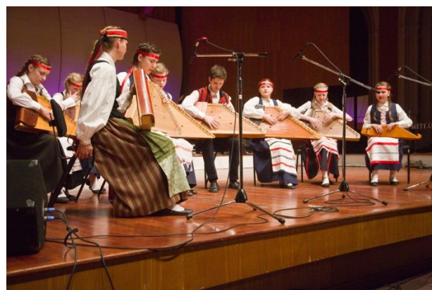
Participants of the Festival "Riga Gingerbread" , Riga, 2015