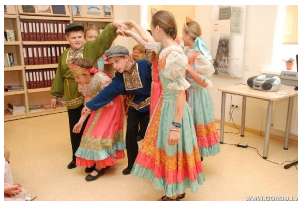
Children's dance group, Daugavpils, 2012