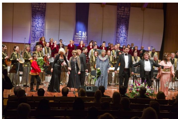
The opening ceremony of the jubilee DRCL in 2015.