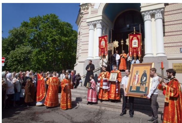
Religious procession in the Cathedral of the Nativity of Christ, 2011

In 2011, within the framework of the restored Days of Russian Culture in Latvia, 73 events were held, which took place in Riga, Daugavpils, Rezekne, Jurmala, Jaunolain, Jelgava, Wilani. These were performances, concerts, presentations of new books and almanacs, a large-scale family holiday was organized in the Verman Garden.