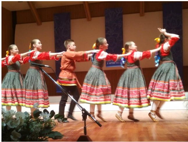
Children and youth dance group "Zadorinka" in Riga 2019