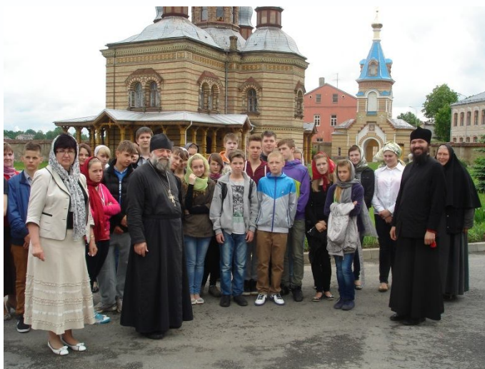
The meeting of the students of the 2nd secondary school of Jekabpils with the clergy of the Holy - Spirit men's Monastery, Jekabpils, 2013