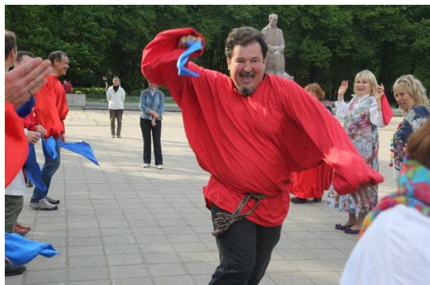
Rite "Pacing behind the sun" on the Esplanade, Riga, 2017